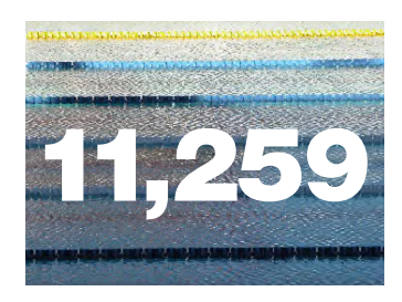
With 11,259 members at the end of 2013, Pacific Masters is larger than the next 3 largest USMS local organizations combined.