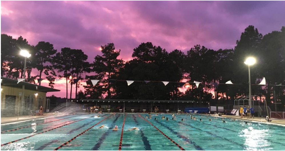
SUNSET PRACTICE AT FLEET AQUATICS MASTERS