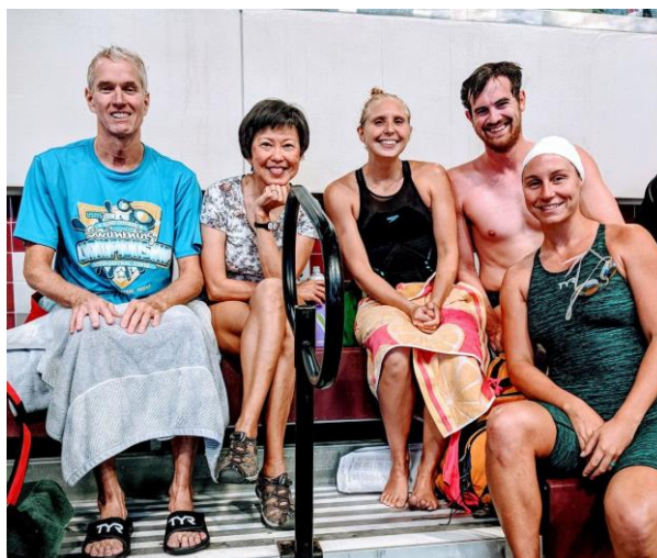
Dad's Club Swimmers at Texas A&M Zone Championship Meet

Located at 1006 Voss Road, Houston, TX 77055, Dad's Club has three outdoor pools: a 25 yard pool, a 33-1/3 yard pool, and the newly renovated 50 meter x 25 yard main pool. There is also a fitness center on site with cardio equipment, free weights, and weight machines. For more information about Dad's Club, go to: http://www.dadsclub-swimteam.com/master-triathlon/tri-swim-training